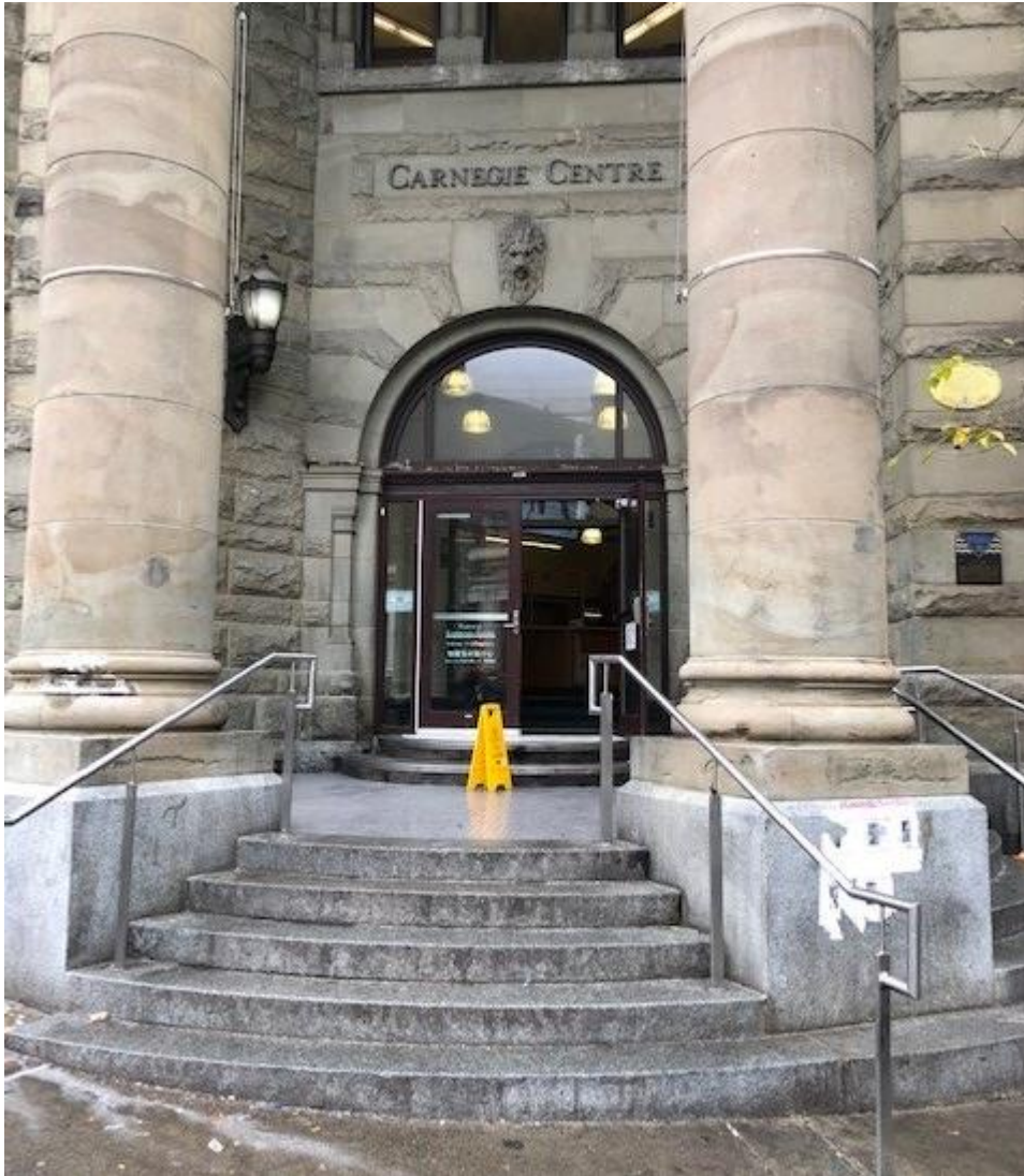
Photo of Carnegie Community Centre's front entrance.